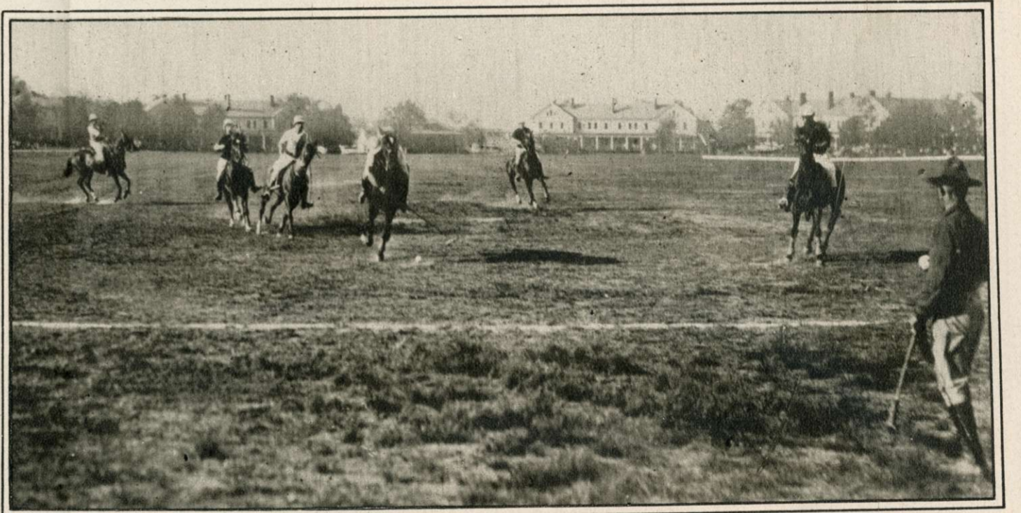
When the Sixth Cavalry Played Fort Bragg Team.