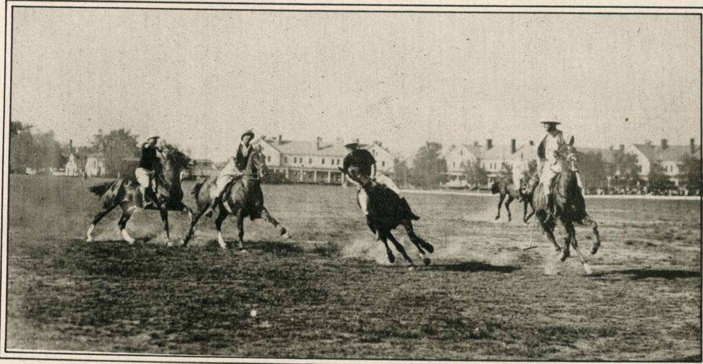
An Exciting Moment Sixth Cavalry Versus Fort Bragg.