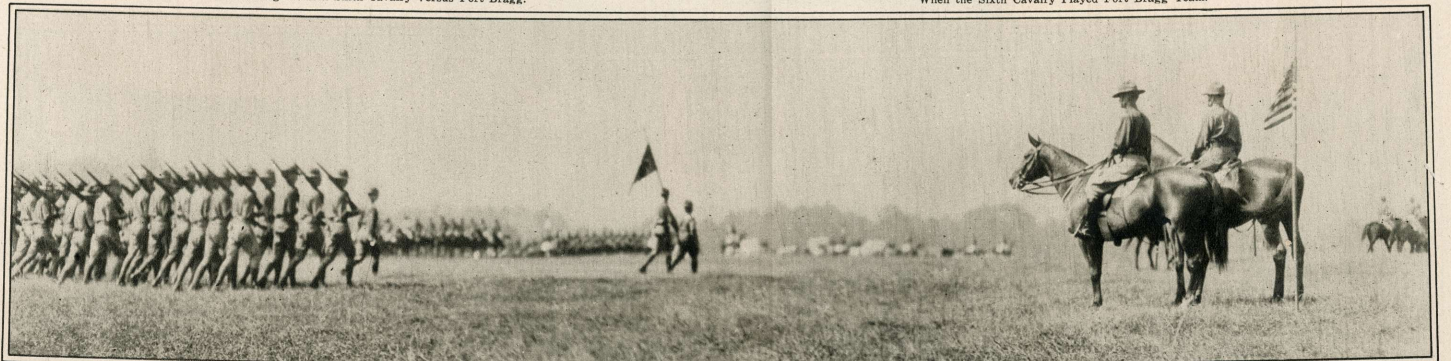
Recent Review at Oglethorpe.