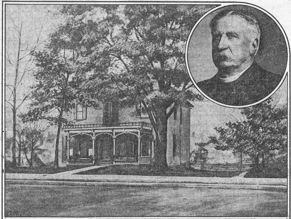
This Residence Was Formerly Known as 227 McCallie Avenue

and, if matters still improve, go away the last of next week and